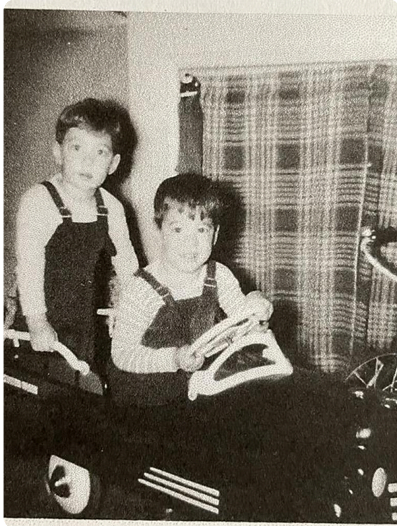
My first car